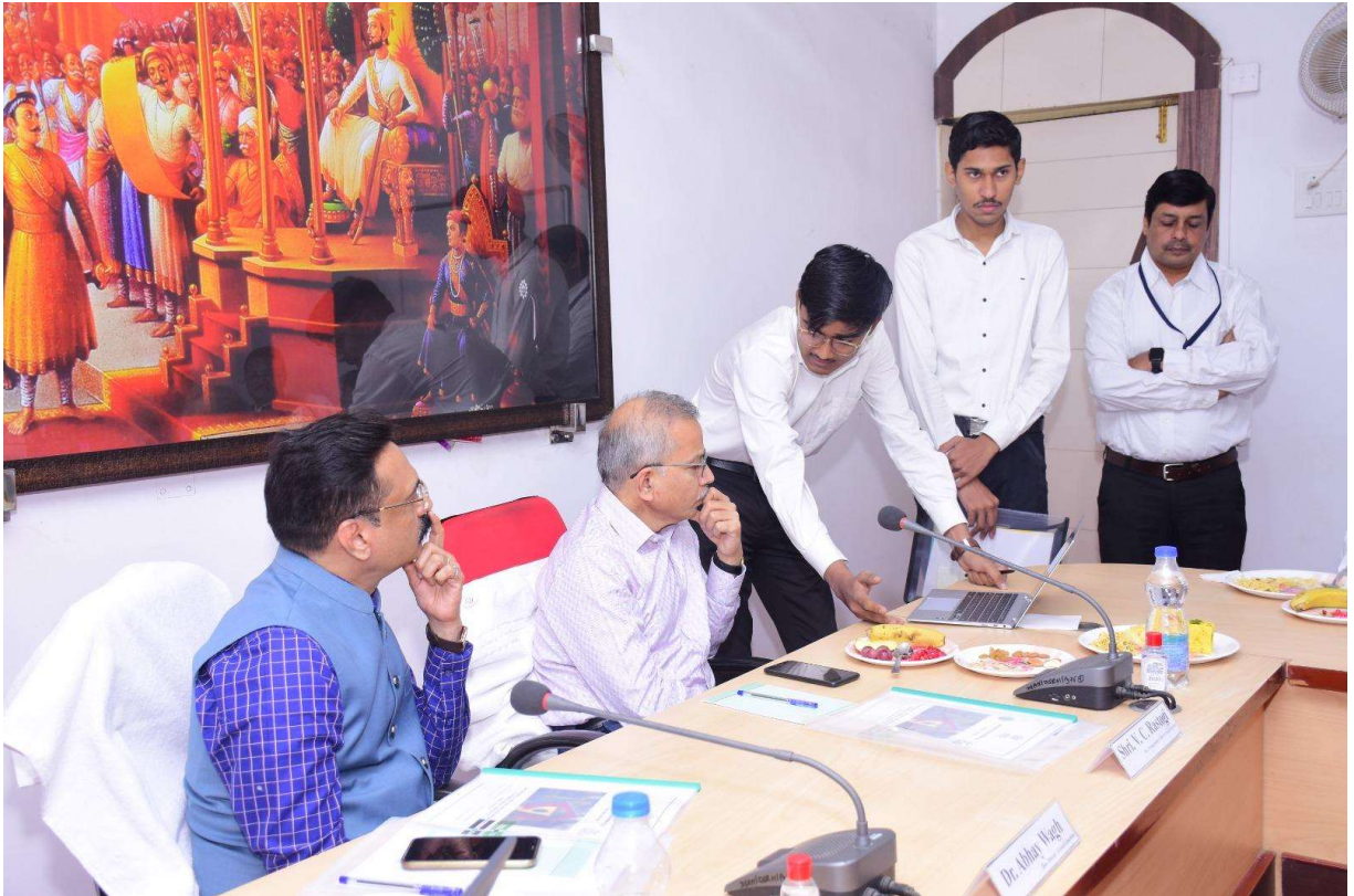
Presentation with Hon Secretary, Higher and Technical Education, Government of Maharashtra