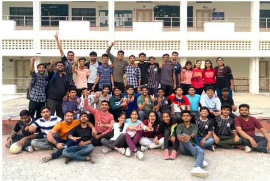
(Final year enjoying their time of victory)