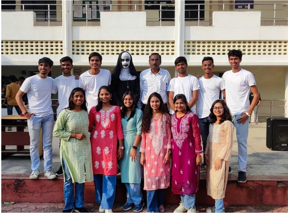
(Flash Mob dance crew)