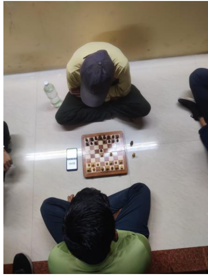
(glimpses of chess)