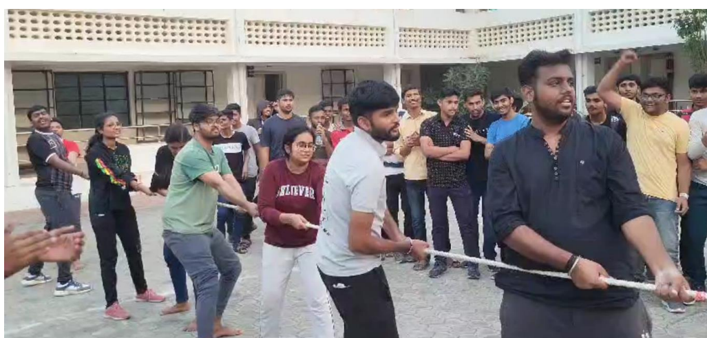
(Random moments of play spirit)