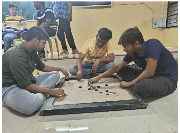
(glimpses of Carrom)