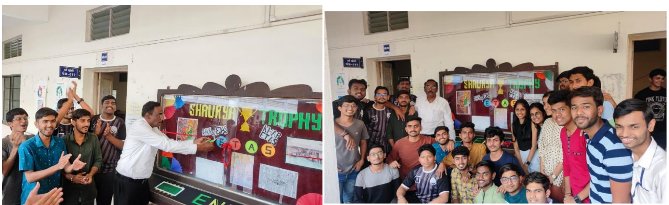
(inauguration of the ETAS board)

Following are the highlights and glimpse of the event: