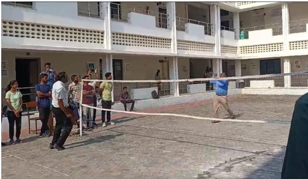
(HoD sir and our teachers enjoying their moments of feeling nostalgic)